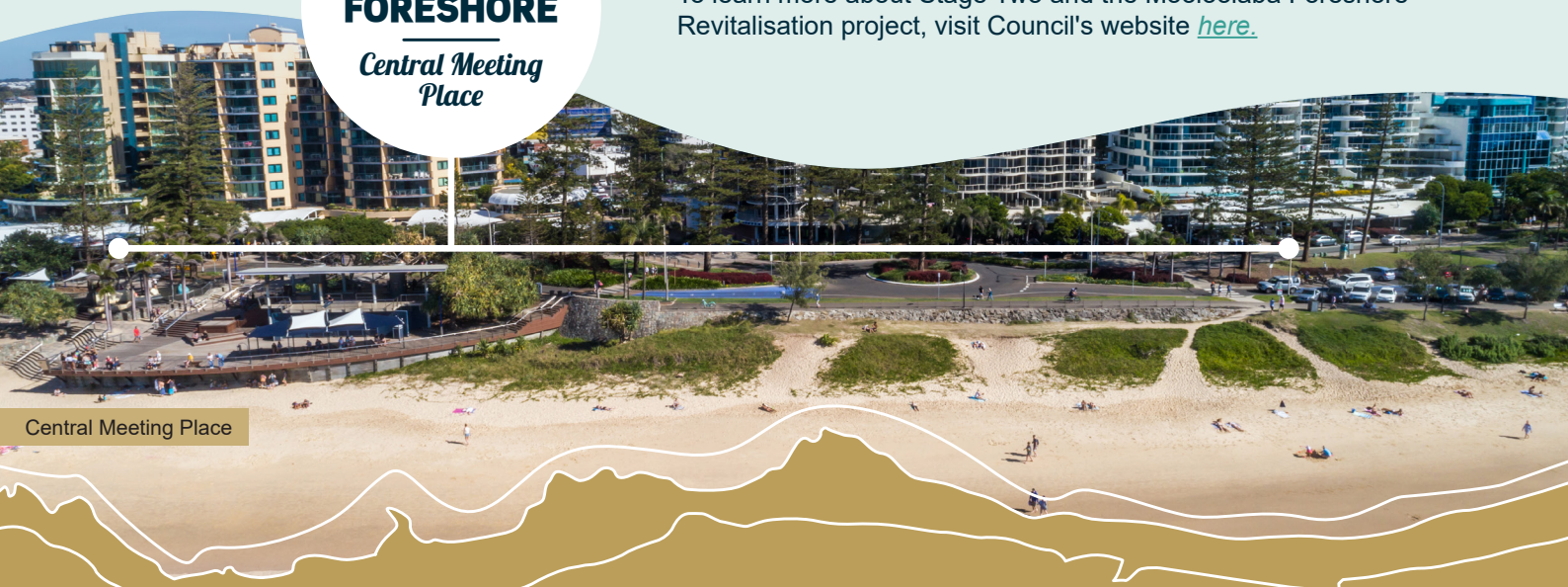
Central Meeting Place