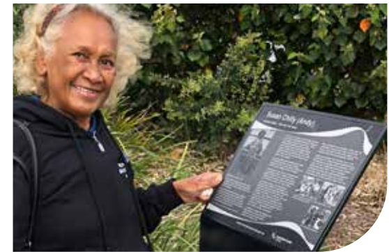
Kabi Kabi Peoples interpretative sign, Muller Park, Bli Bli

Opportunities for educational experiences in parks are not limited to historical topics. Many recreation parks across the network contain educational embellishments about the diverse flora and fauna of our region. Embellishments explaining ecological processes have also been incorporated into a number of play spaces, encouraging children to learn about the natural world around them.