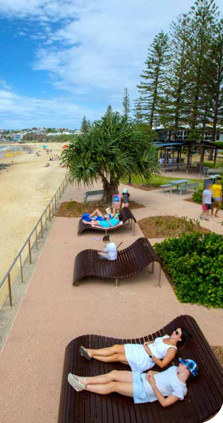
Alexandra Headland Foreshore