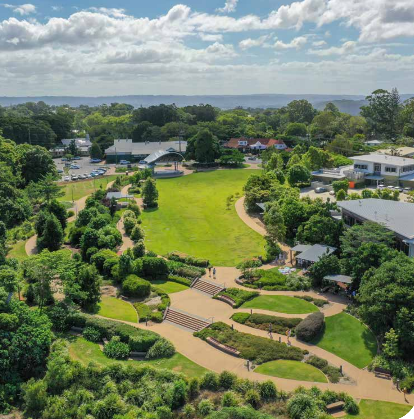
Buderim Village Park