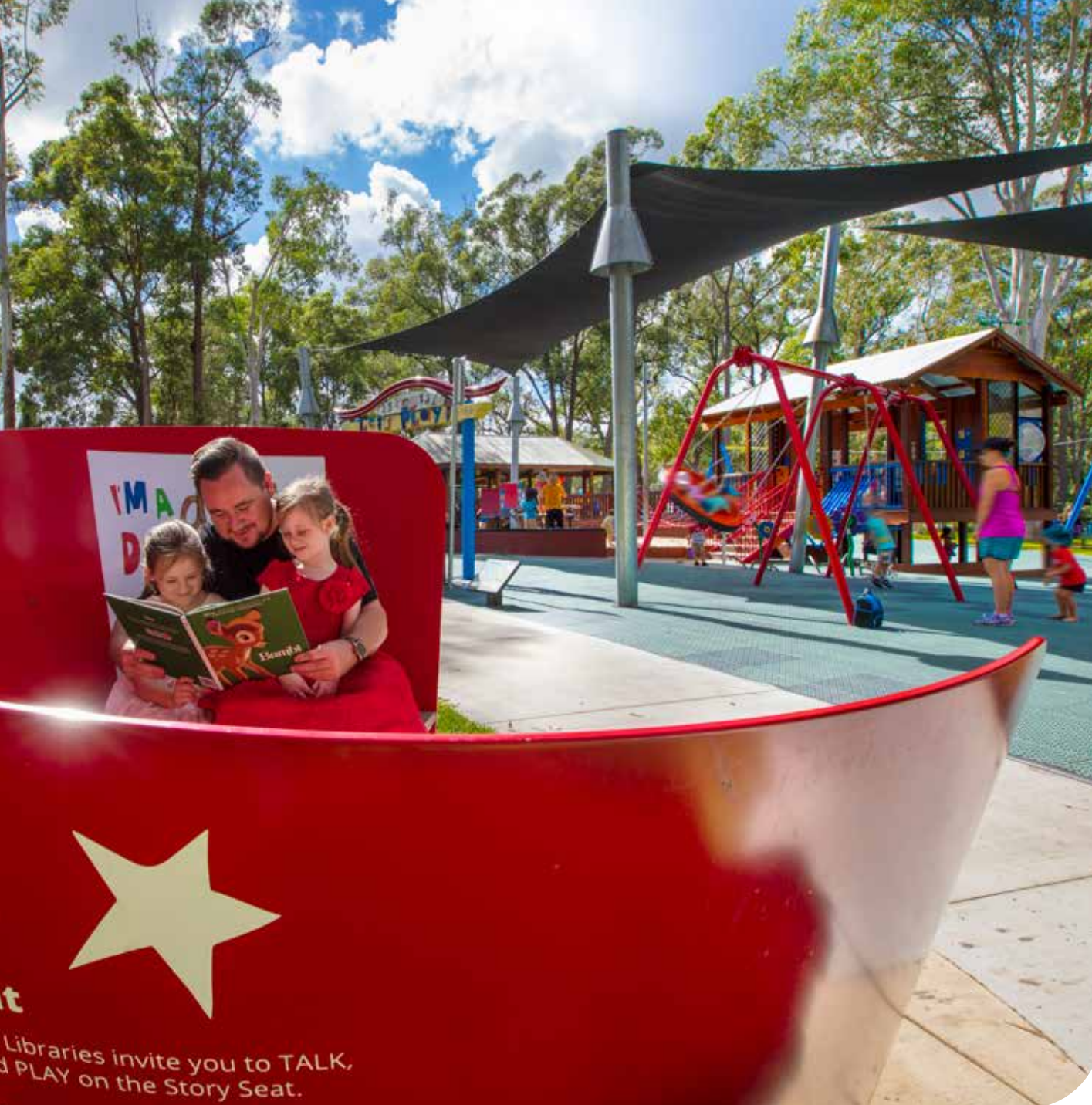
Pioneer Park, Landsborough