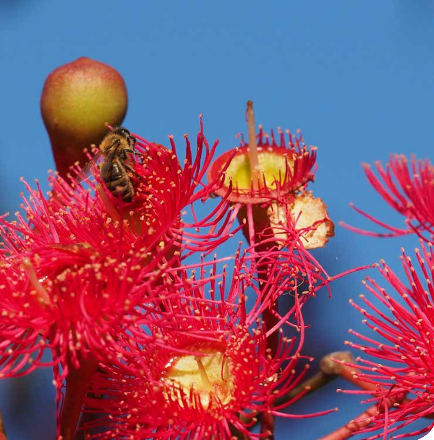
WaranaApis Mellifera on a Corymbia Hybrid 'Summer Red' Flowering gum