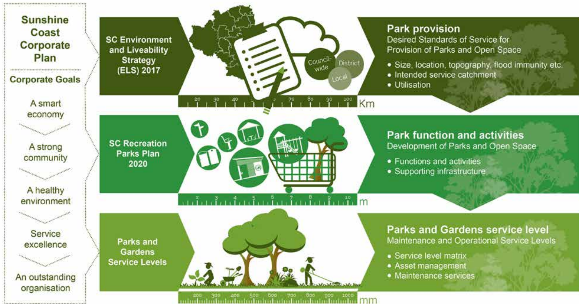
Figure 2: Parks and gardens policies and strategies alignment