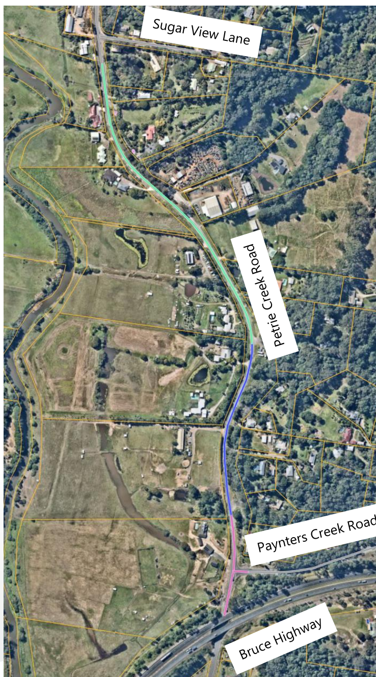
Figure 1: Project Staging

Stage 1 - Bruce Highway Overpass to western Service Road intersection