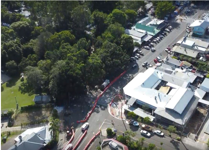
Figure 2. February and March works area - Memorial Drive-Etheridge Street intersection vicinity