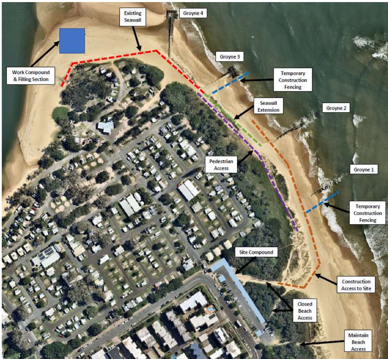
Figure 2: Community access areas and temporary closure of beach access and partial carpark areas