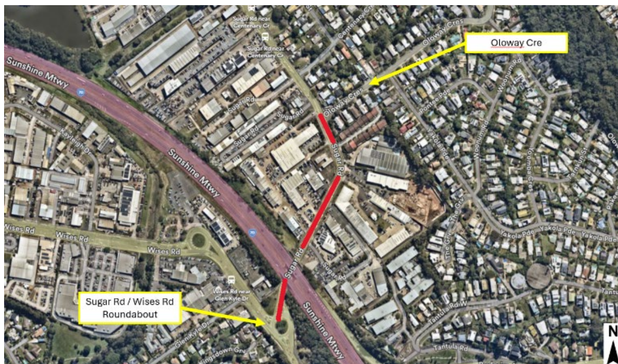
Figure 1: Sugar Road location of interim works - south of Oloway Crescent and north of the Sugar-Wises Roads roundabout.