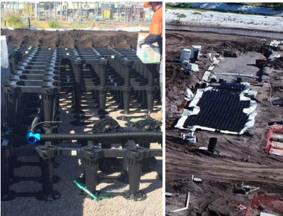
Installation of strata vault system for street trees