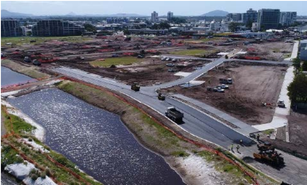
Stage 1A works – kerbing and asphalt works

Stage 1A main civil / subdivisions works – Progress on the main Stage 1A civil works continues though some delays have been experienced over the period with BOM rainfall figures showing a 196% higher than the February average; and there having also been sub-contractor / supply delays. Civil works completion is estimated to be in August 2018. The photographs below show the range of works currently being carried out across Stage 1A. Important milestones have been: completion of the majority of below ground infrastructure; and the commencement of footpaths, kerbing and asphalt laying.