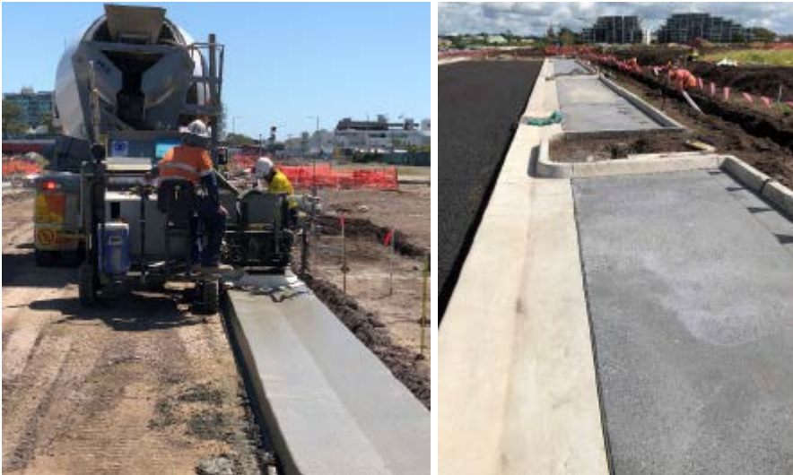
Slip-form kerbing works