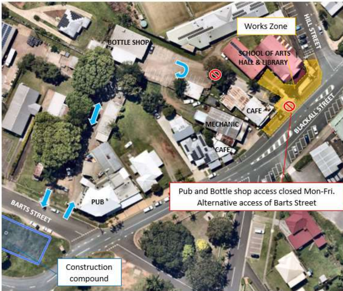
Figure Two. Temporary access changes to pub and bottle shop. Each Monday to Friday afternoon. All works subject to weather and site conditions