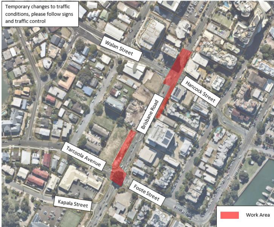
Figure 1. Night works construction areas. Local access remains for residents & businesses

For further information, you can contact the project team on 1800 531 597 (during office hours, Monday to Friday 8.30am – 5pm) or email mtcu@sunshinecoast.qld.gov.au