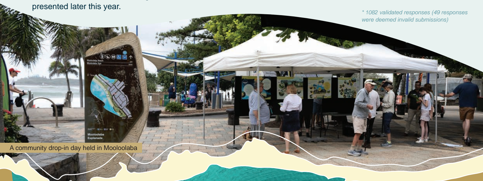
A community drop-in day held in Mooloolaba

* 1082 validated responses (49 responses were deemed invalid submissions)