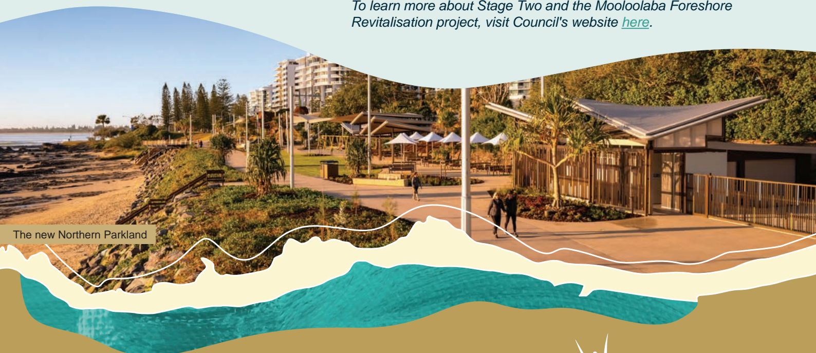
The new Northern Parkland

To learn more about Stage Two and the Mooloolaba Foreshore Revitalisation project, visit Council's website here .