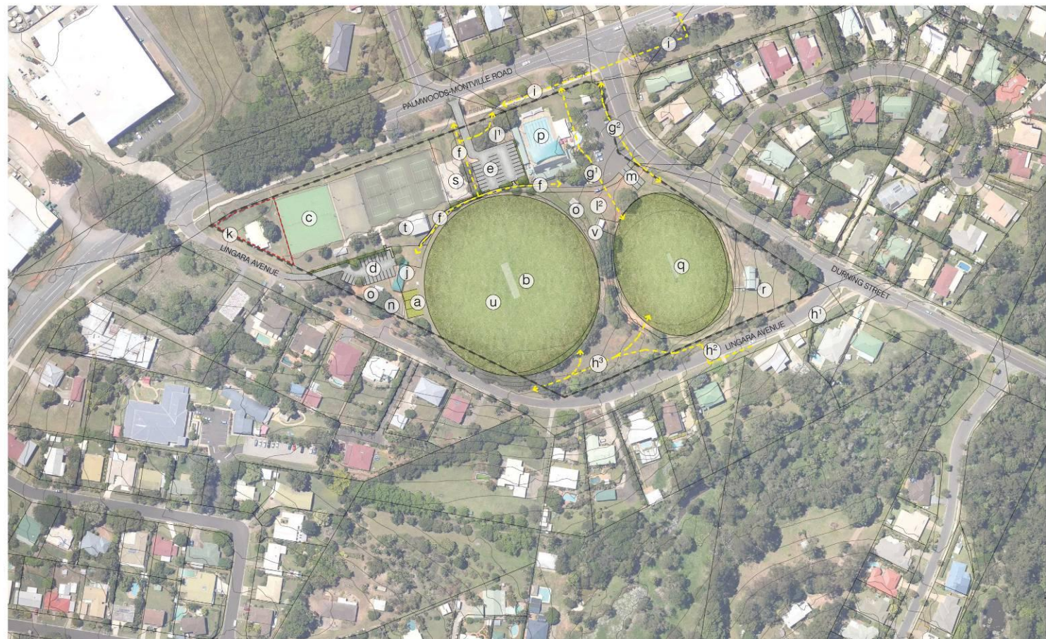
Figure 3- Palmwoods Sport and Recreation Reserve Master Plan