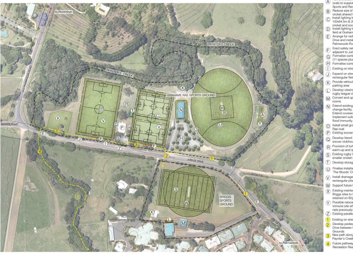
PALMWOODS SPORTS PRECINCT MASTER PLAN Briggs and Grahame Rae Sports Ground