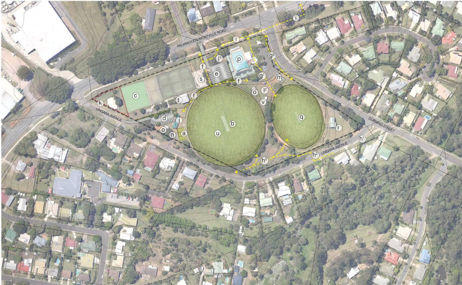
Figure 3- Palmwoods Sport and Recreation Reserve Master Plan