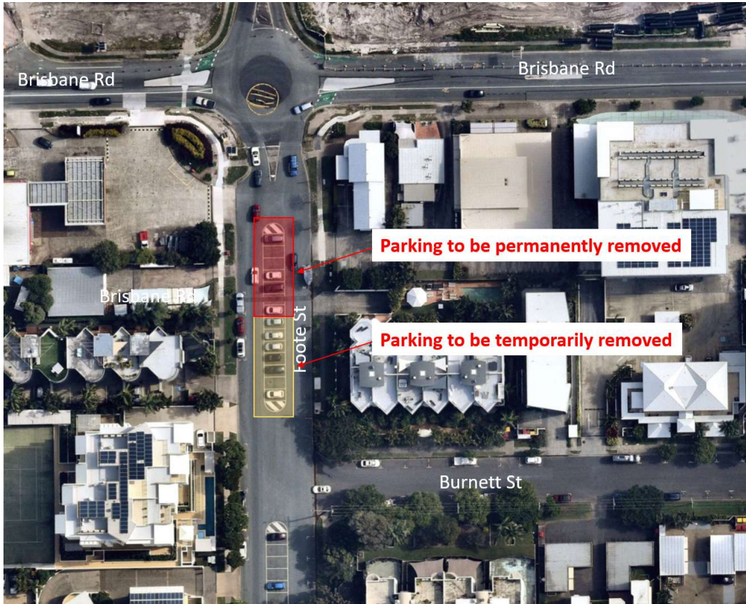
Figure 1 – Changes to parking conditions and areas of construction, Footo Street Monday 7 November to Friday 18 November 2022, 6am - 6pm