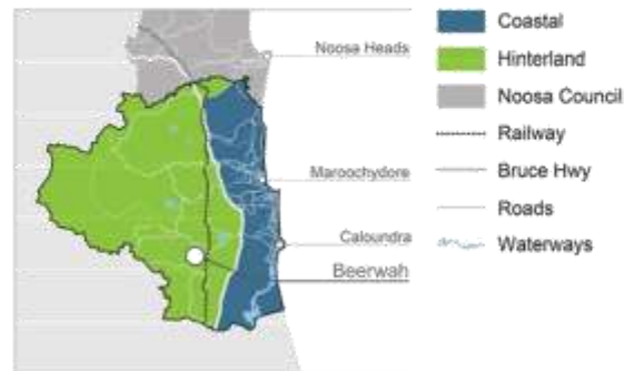
Figure 1: Context Map