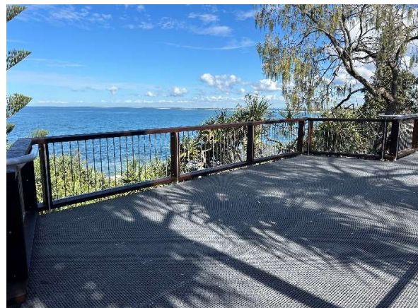
Left to right: Images of the new coastal boardwalk pathway.

The road will reopen to two way traffic by Saturday 13 July.