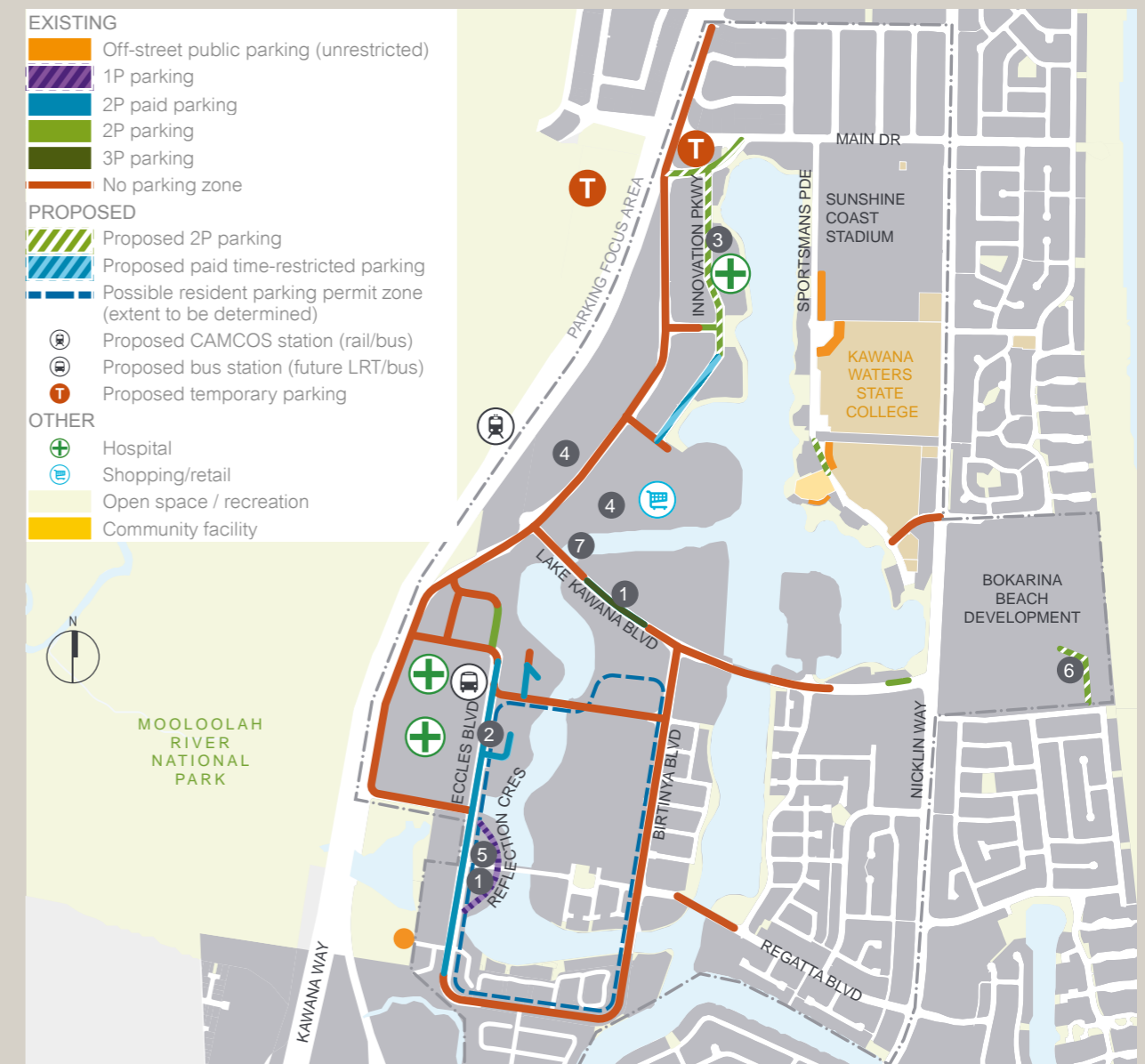
Parking actions - Birtinya