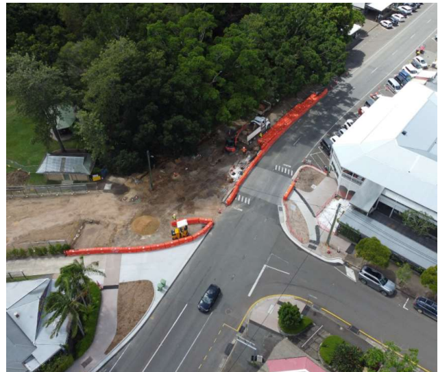
Figure 1 Memorial Drive - Etheridge Street Stage 1 works.

You can view the full streetscape design on the project webpage .