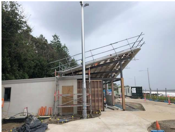
Figure 2. The new public amenities building taking shape