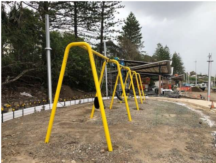
Figure 1. New swing set installation as part of the new Adventure Playground