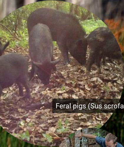
Feral pigs ( Sus scrofa )