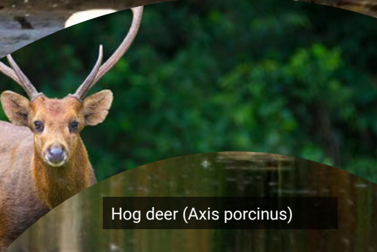
Hog deer ( Axis porcinus )