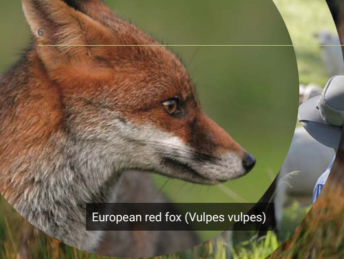
European red fox ( Vulpes vulpes )