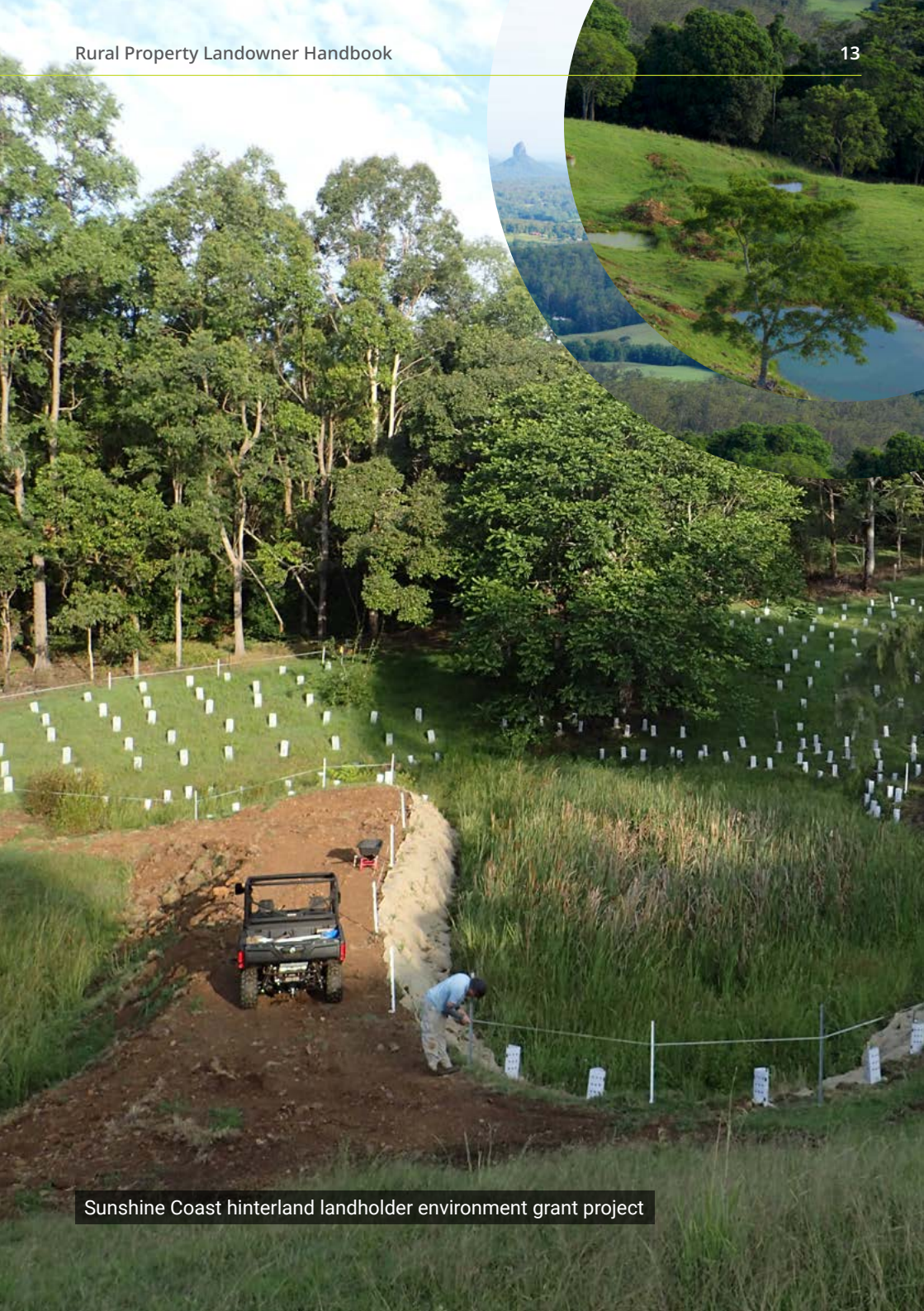
Sunshine Coast hinterland landholder environment grant project