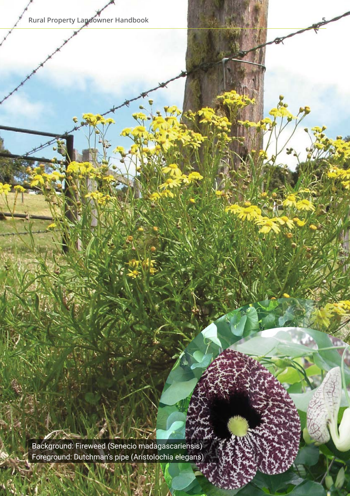
Background: Fireweed ( Senecio madagascariensis ) Foreground: Dutchman's pipe ( Aristolochia elegans )