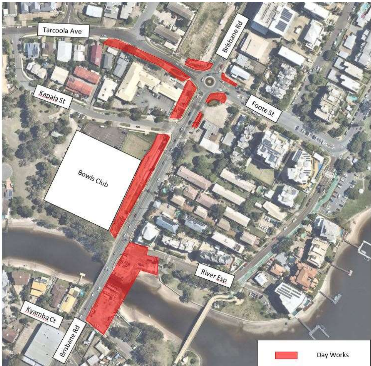
Figure 1. Day works construction areas* – March and April 2022

*The timing and boundaries of each area are indicative only and subject to change dependent upon weather, site conditions and equipment and materials availability. Major service relocations and upgrades including power, telecommunications, sewage, water and stormwater will take place at various locations, and at various times throughout the entire construction program. These service works are independent of the construction zones and timelines and will be undertaken by service providers including Energex, NBN, Telstra and Unitywater in cooperation with Hall Contracting.