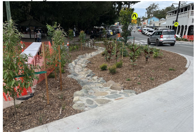
Figure 1 Street furniture and landscaping continuing

Continued installation of new street furniture and landscaping.