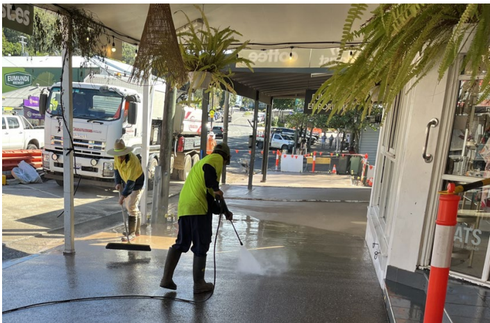
Figure 3 Footpath pour outside EATS