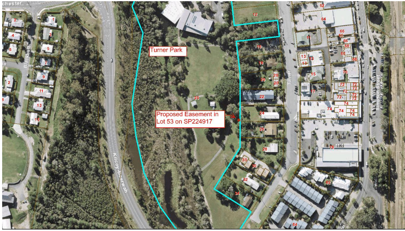
Proposed Easement in Lot 53 on SP224917