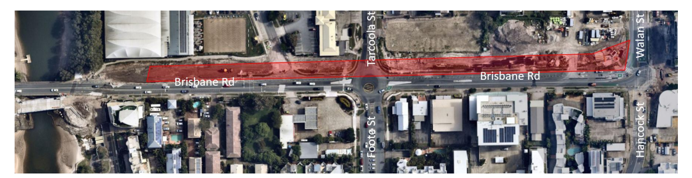
Figure 2. Night works - Tuesday 6 September to Thursday 8 September (inclusive)*

Sunday 4 September to Monday 5 September (inclusive) Brisbane Road/Walan Street/Hancock Street intersection east to Burnett Street, west to Smith Street and north along Brisbane Road to near the entry to the ParknGo Mooloolaba Central car park.