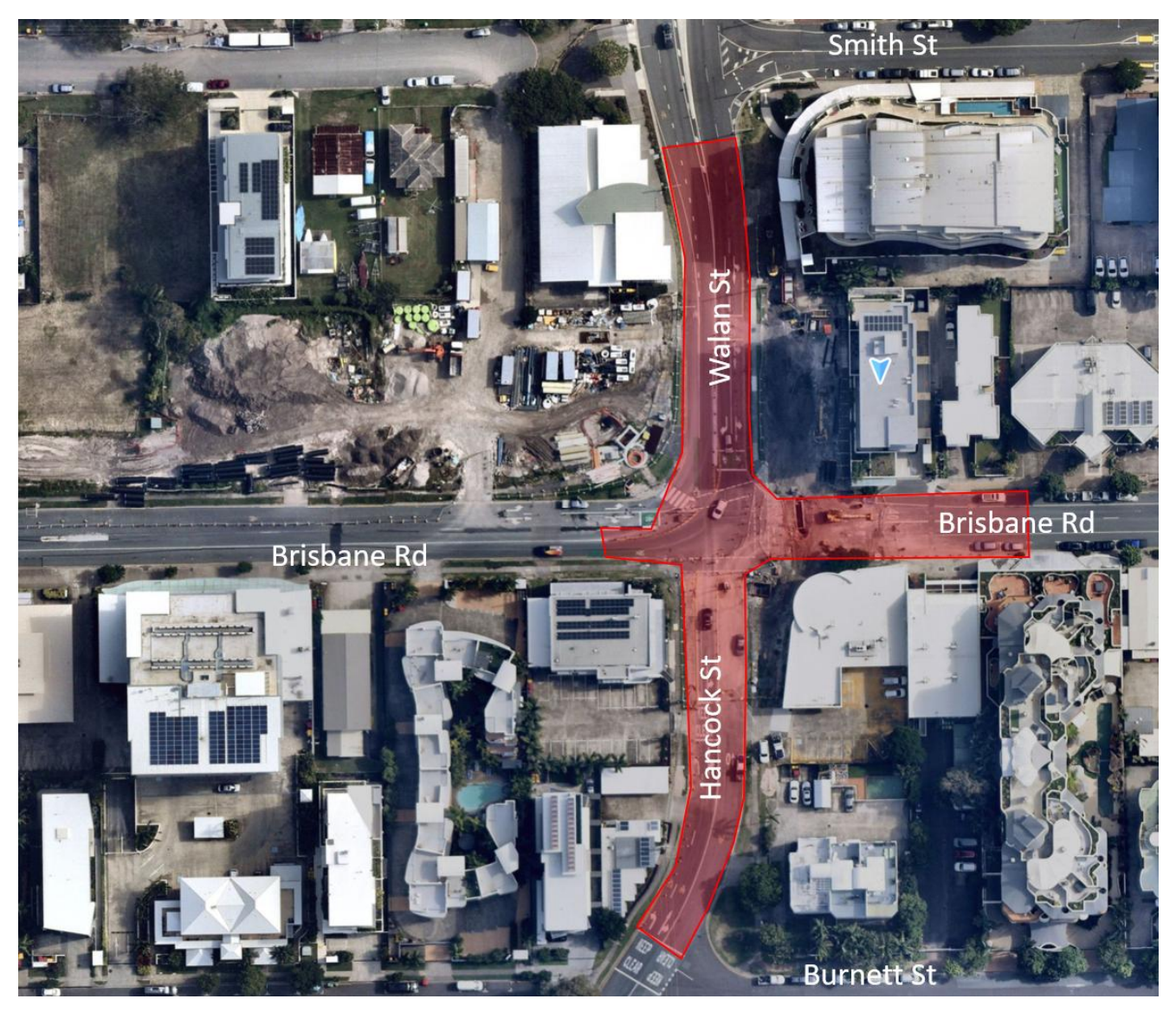
Figure 1. Night works - Sunday 28 August to Monday 5 September (inclusive)*

Sunday 28 August to Thursday 1 September (inclusive) Brisbane Road/Walan Street/Hancock Street intersection