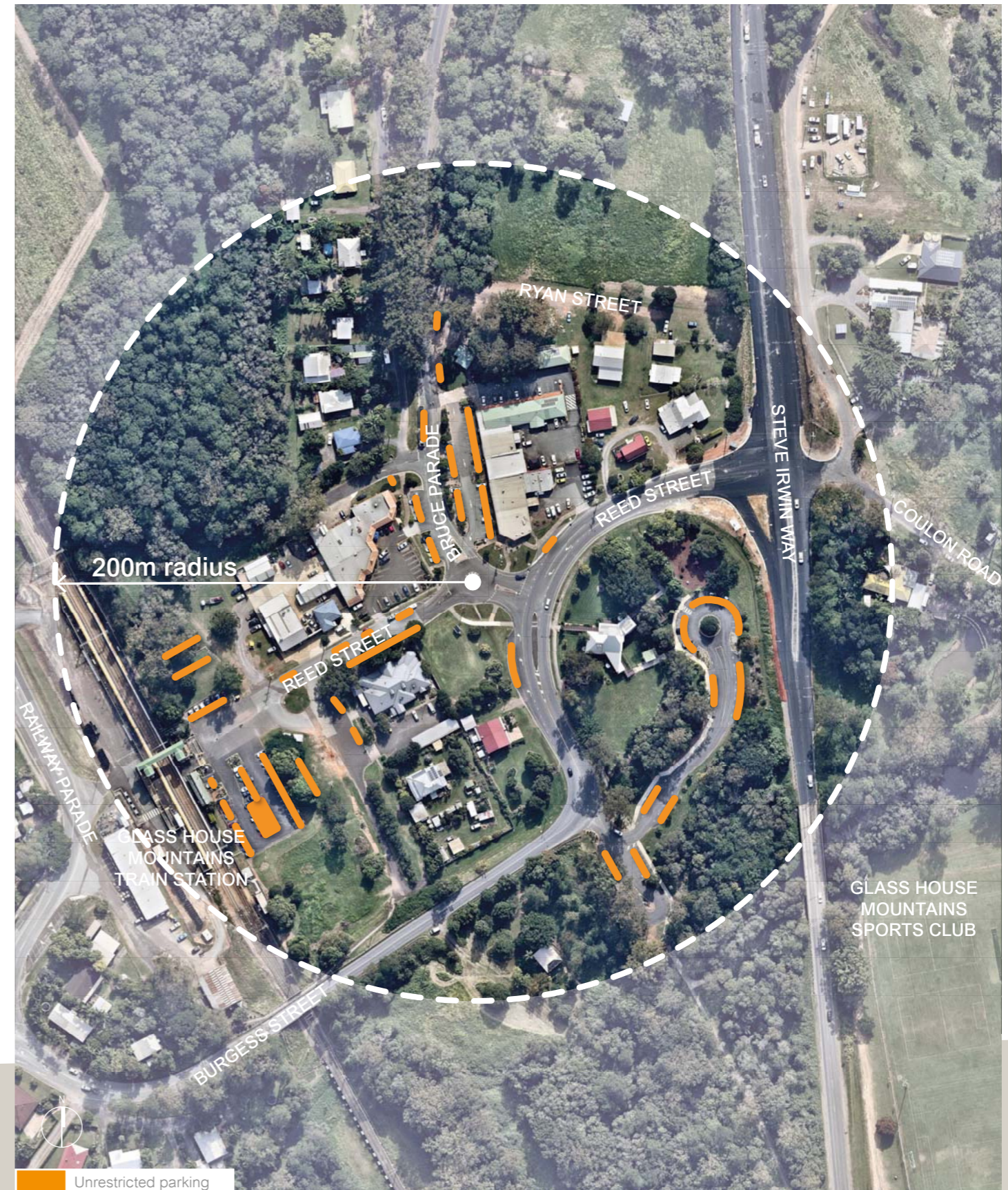
Glass House Mountains parking focus area

Data reflects the combined growth figures for the combined area of Glasshouse, Glass House Mountains, Beerburum, Coochin Creek and Bribie Island North.