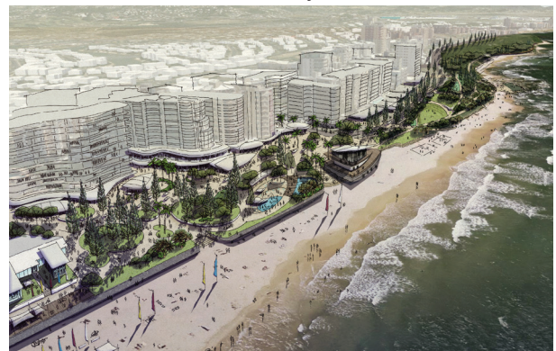
Artist impression of a revitalised Foreshore & Esplanade (for illustrative purposes only)

The draft master plan is an aspirational and visionary document that explores a range of opportunities and initiatives to provide direction towards Mooloolaba becoming an outstanding tourist and residential locality.