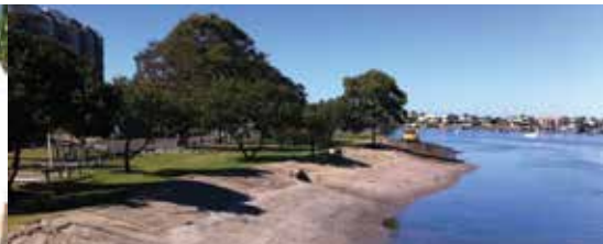
Beach after general maintenance