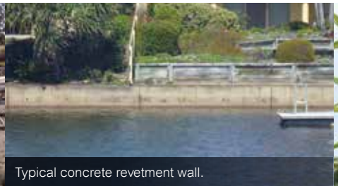
Typical concrete revetment wall.