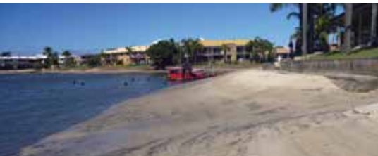
A well-maintained profile

There is an ability for residents to undertake private works, at their cost, and by an approved dredge operator, where the request is outside of council's service levels (3-4 years) and not a legislative requirement of Council.