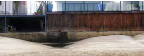
Inadequate stormwater drainage results in beach erosion.

Stormwater management on properties is the sole responsibility of residents, however council can provide advice on request.