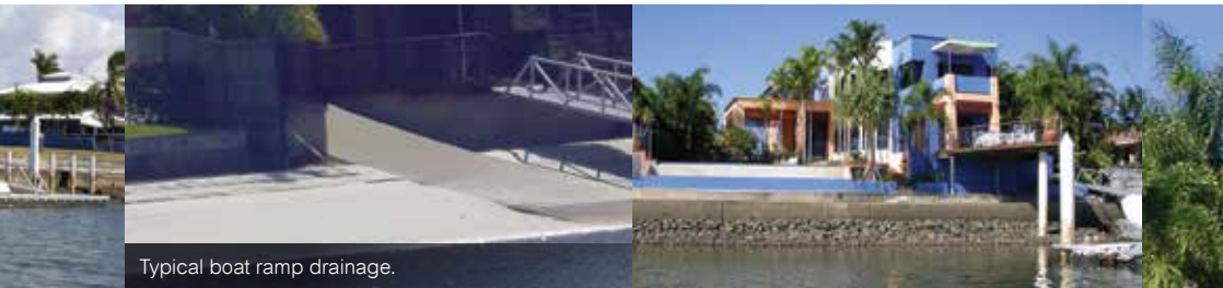
Typical boat ramp drainage.

Once again, it is essential that property owners should contact council's Customer and Support Services on 07 5475 7526 if considering constructing a deck, pontoon, jetty or other structure. Officers will provide free and clear specific advice about whether a development application is required.