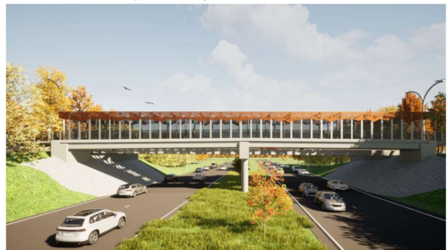
Figure 1 Artist impression - new pedestrian and cycle bridge.

To contact Council's project team directly Please email: stringybarkbridge@sunshinecoast.qld.gov.au or contact Council's customer service via the details on the base of this notice (please quote Stringybark Road pedestrian and cycle bridge).