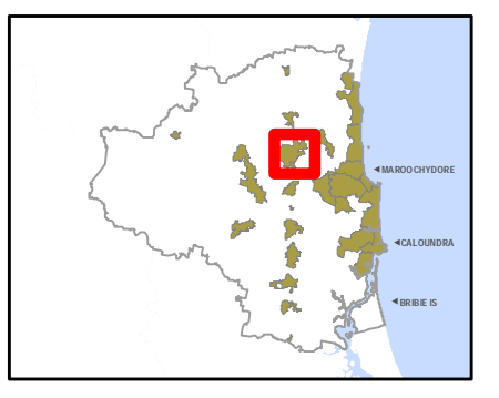
Figure 7.2.22A (Nambour Local Plan Elements)

© Crown and Council Copyright Reserved 2020 Geocentric Datum of Australia 2020 (GDA2020)