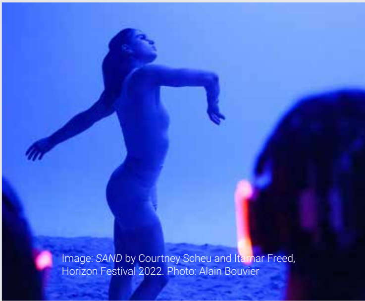
Image: SAND by Courtney Scheu and Itamar Freed, Horizon Festival 2022.