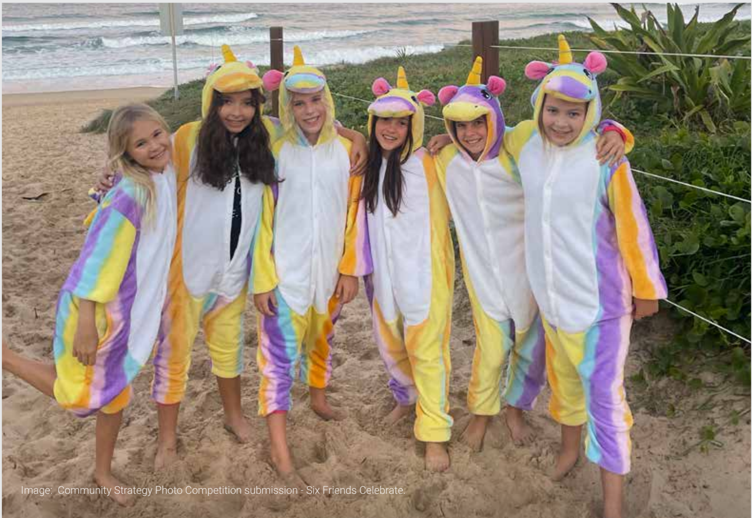
Image: Community Strategy Photo Competition submission - Six Friends Celebrate.