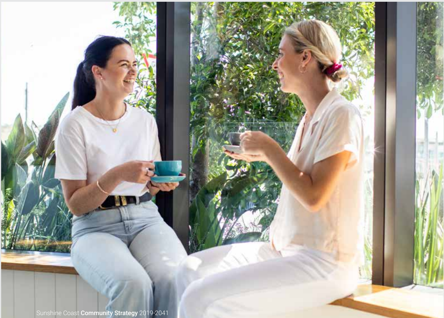
Sunshine Coast Community Strategy 2019-2041