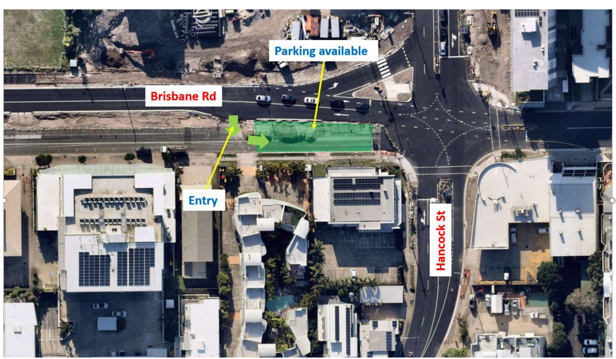
Figure 1 Temporary parking for Medical Centre and Pho Bui Vietnamese restaurant (patients, staff, customers)

For further information, you can contact the project team on 1800 531 597 (during office hours, Monday to Friday 8.30am – 5pm) or email <a href="mtcu@sunshinecoast.qld.gov.au">mtcu@sunshinecoast.qld.gov.au</a>