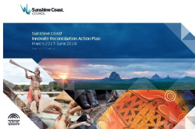
First Nations Procurement Guideline