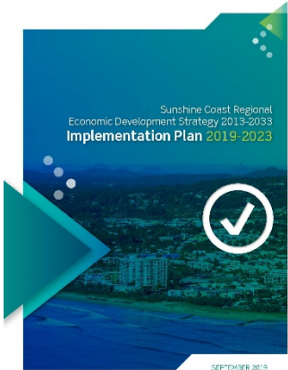
Local Preference in Procurement Guideline