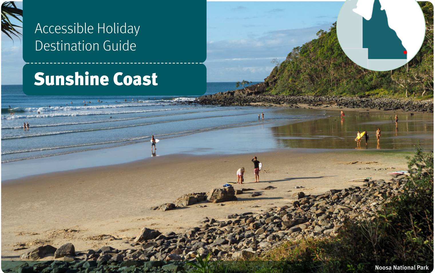
Noosa National Park

The Sunshine Coast stretches from the coastal city of Caloundra, near Brisbane, to the Great Sandy National Park in the north. The coast not only has more than 100 kilometres of white sandy beaches but also has heritage-listed rainforests and national parks and is dotted with historic villages.