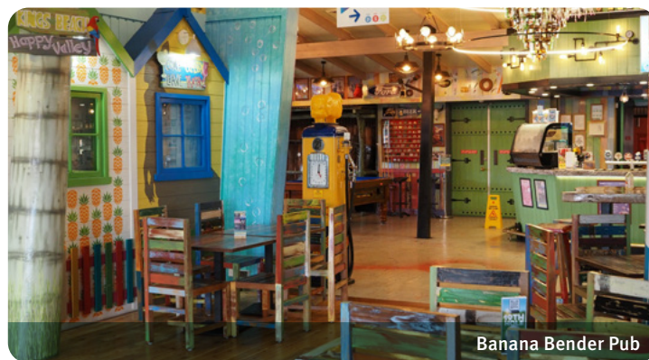
Banana Bender Pub

Spend a relaxing final day on the beach at Caloundra. Choose from the sheltered Bulcock Beach and the calm waters of the Pumicestone Passage, the rockpool at the Pavilion or the surf of the world famous Kings Beach.