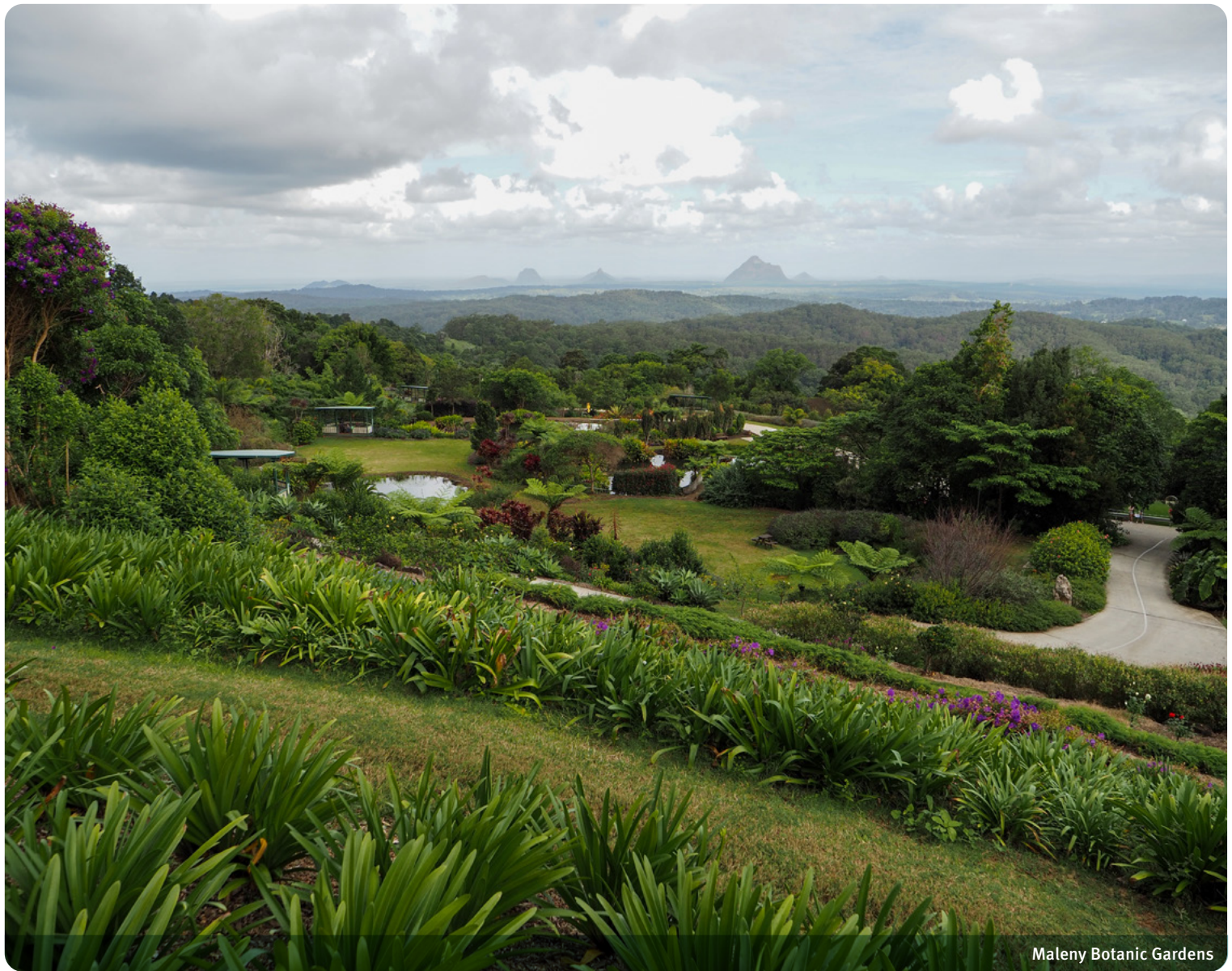
Maleny Botanic Gardens

through bird aviaries house more than 700 native and exotic birds from around the world. The gardens are built on a steep site which may pose some challenges for people with limited mobility. Disabled parking is available next to the visitors' centre. Accessible toilets are available adjacent to the centre. Entry to the centre and café is level. The four bird aviaries are wheelchair accessible. Golf buggies are available for hire and are recommended to explore the gardens fully. Wheelchair users would need to be able to transfer into the buggy.