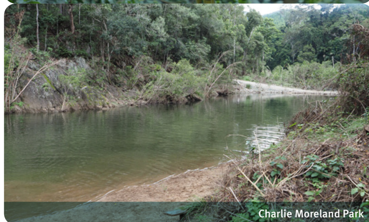
Charlie Moreland Park