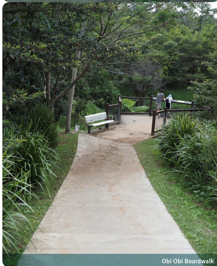
Obi Obi Boardwalk