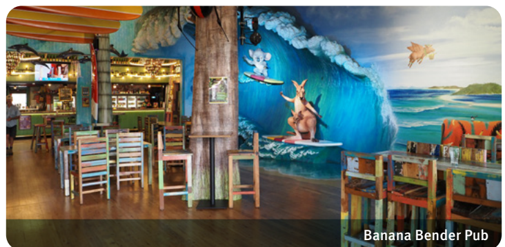
Banana Bender Pub

The Noosa Botanic Gardens is a 25 minute drive inland from Noosa Heads on the banks of Lake MacDonald. The gardens are a great place for a walk or picnic. The gardens feature a rainforest, numerous ponds, a zen garden, a shade garden with a large collection of ferns, a bush chapel, open lawns and a spectacular amphitheatre. The pathways through the garden are all paved. The slopes throughout the gardens are gentle, especially along the signed green trail. The amphitheatre has wheelchair positions at the end of the entry paths on both sides. An accessible toilet is available near the car park.