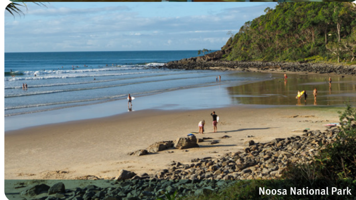
Noosa National Park