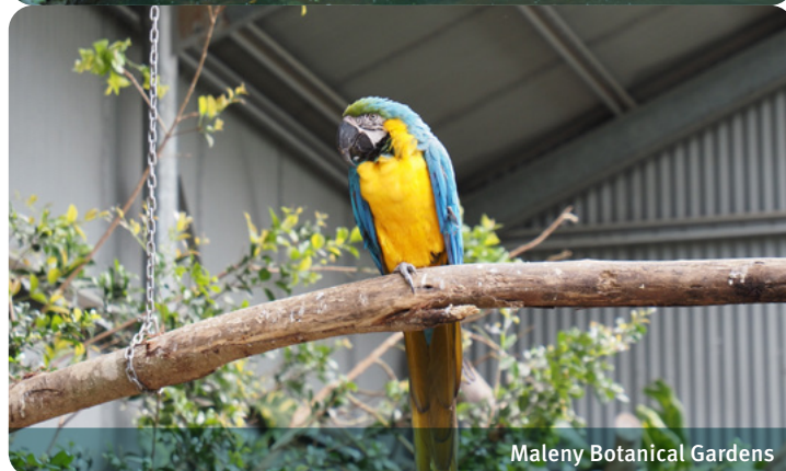
Maleny Botanical Gardens