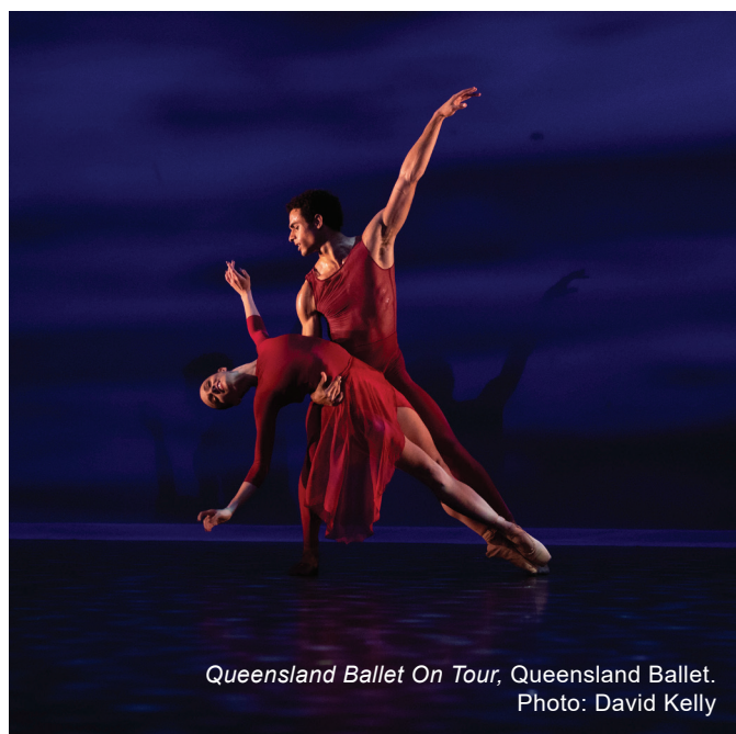
Queensland Ballet On Tour, Queensland Ballet.

Provide excellence in the performing arts