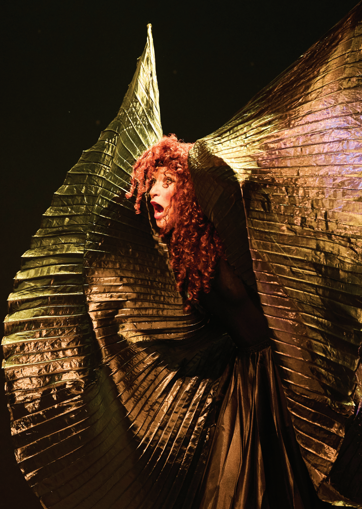
An Evening Without Kate Bush, Hey.Dowling.