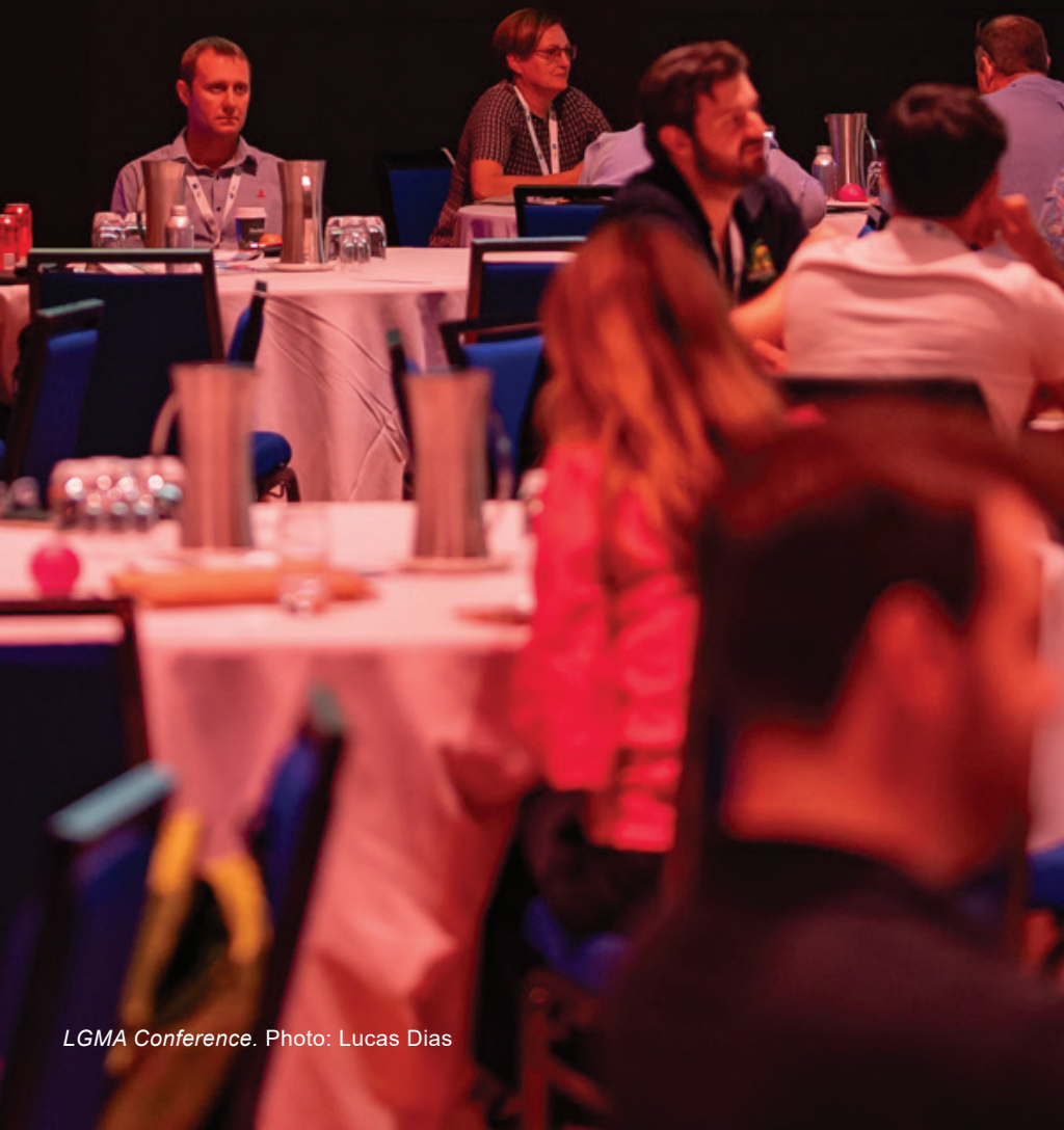
LGMA Conference.