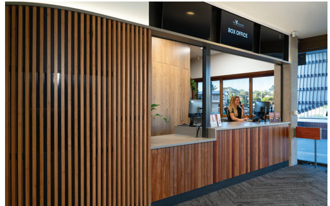
The Events Centre New Box Office.

we remain committed to presenting a first class facility for the delivery of our highly sought after events and performances.