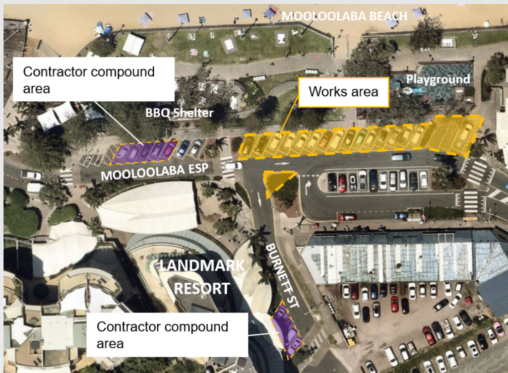
Figure 2 Early works location of areas to be realigned for footpath widening, pedestrian access, loading bay access, PWD Parking access and temporary contractor compounds.

The Mooloolaba Seawall project received funding from the Australian Government.