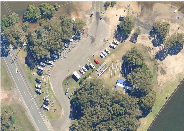
Figure 1: Current site showing informal carpark area with car and trailers.

Locked Bag 72 Sunshine Coast Mail Centre Qld 4560