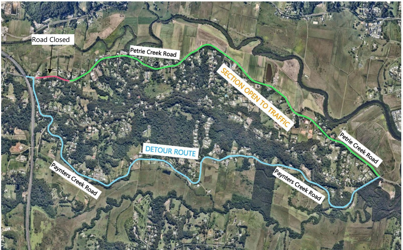
Figure 2 - Stage 2 Petrie Creek access arrangements: Road closed (red section) to non-local traffic. Road open (green section) to all traffic Detour (blue section) via Paynters Creek Road.