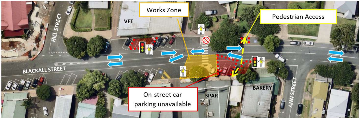
*DAY TRAFFIC ARRANGEMENTS 6am – 8pm. WEST BOUND LANE Raised pedestrian crossing works (weather and site conditions dependent)