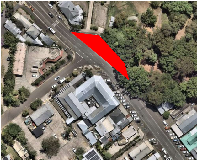
Figure 3. January - March 2025 area of works

Landscaping will follow progressively as construction areas are completed. Over 1,400 new plants including 26 street trees will be planted as part of the upgraded streetscape.