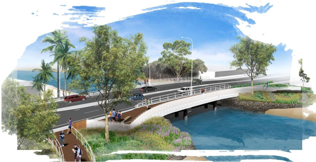
Figure 2. Artist impression of new, four lane Mayes Canal Bridge featuring timber decking and a shared pedestrian and cycle path on both sides of the bridge.