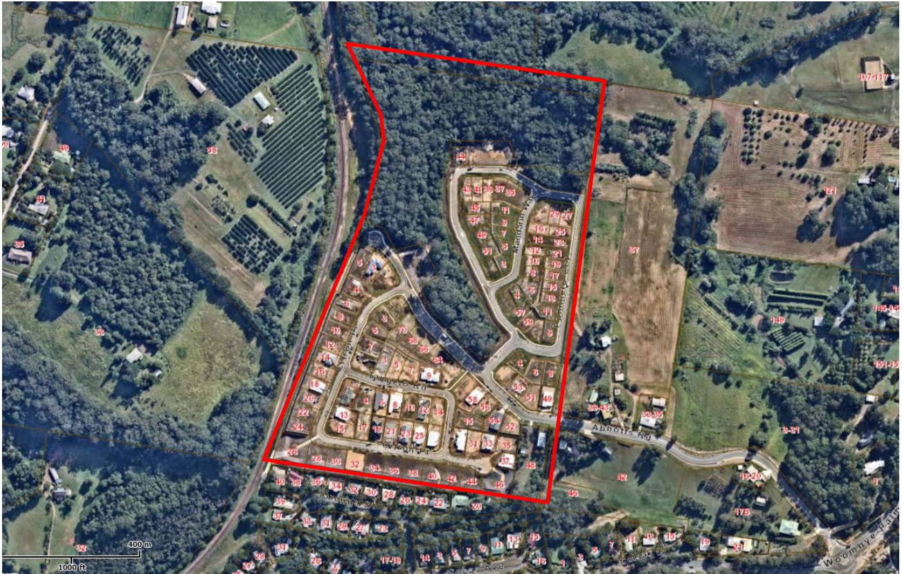
Figure 2 – Location and Surrounds Plan

Figure 2 and 4 below show the location of the subject site in relation to its surrounds: