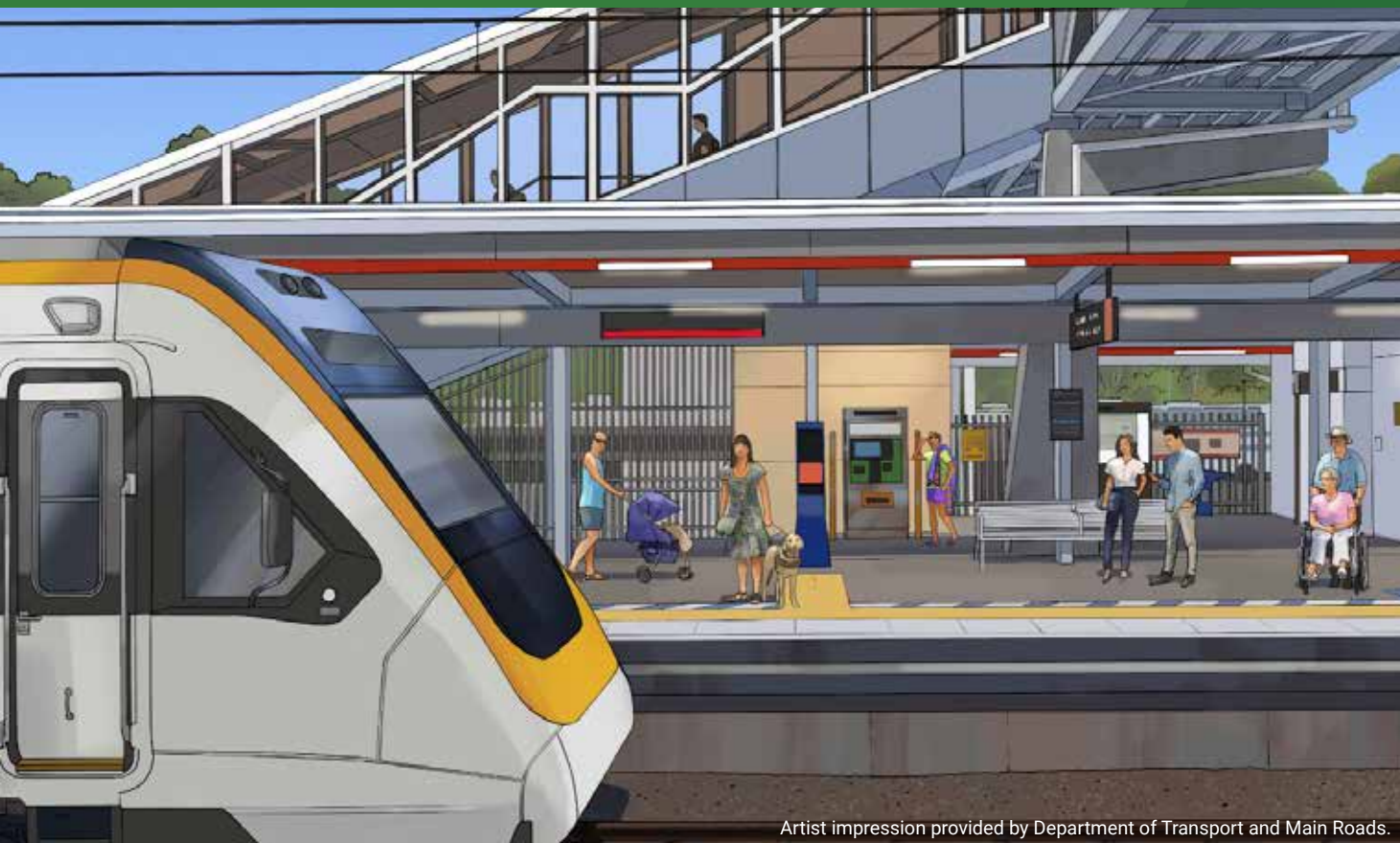
Artist impression provided by Department of Transport and Main Roads.

Council seeks an Australian Government commitment to work with the Queensland Government to fully fund and implement the findings of the Sunshine Coast Public Transport Detailed Business Case.