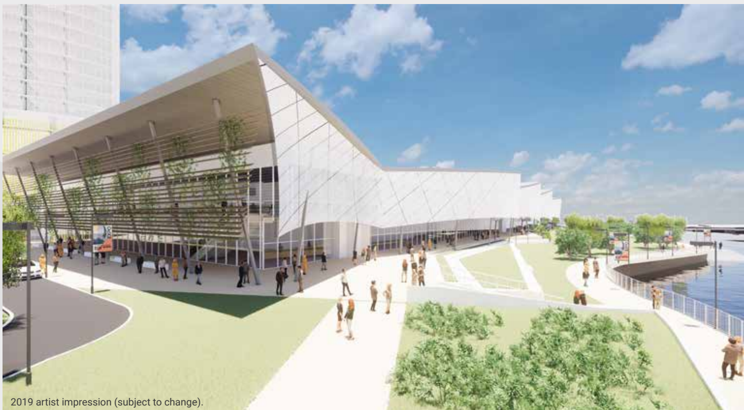
2019 artist impression (subject to change).

Council seeks an Australian Government commitment of $5 million to deliver an updated business case and concept architectural plans for the Sunshine Coast Convention and Performing Arts Centre and a further commitment towards the construction of the facility.