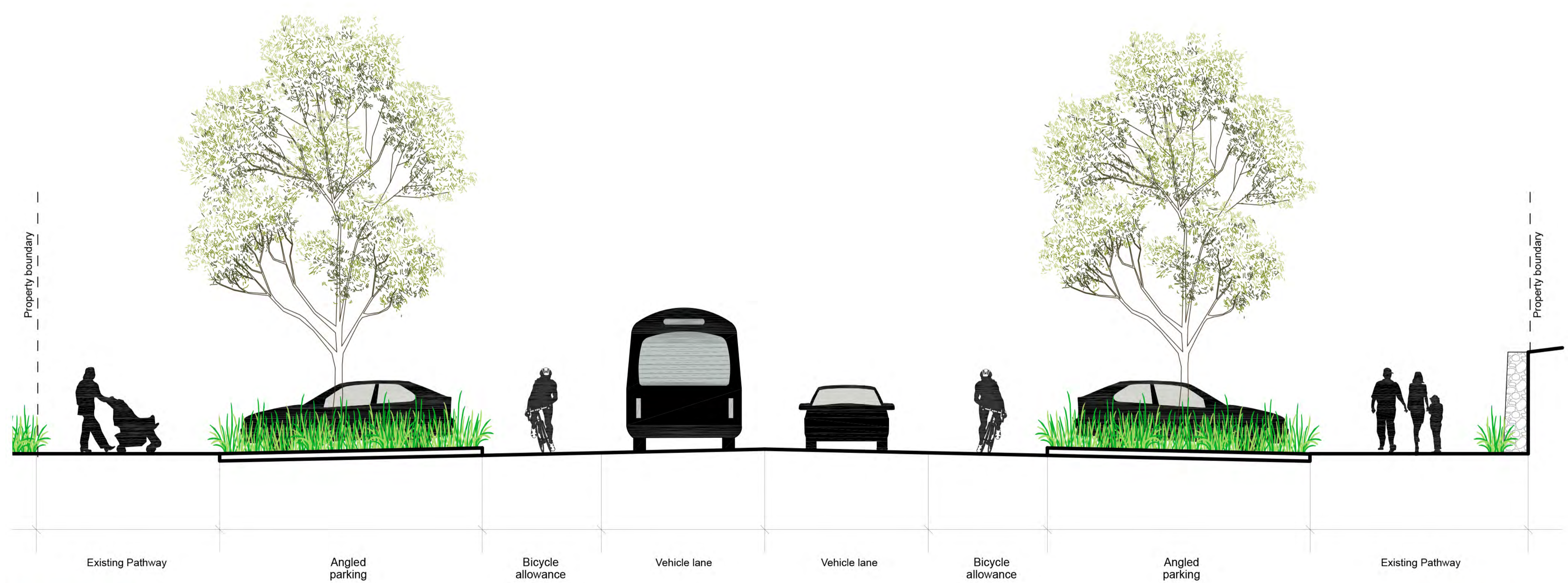
OPTION 2 Margaret Street - Section BB