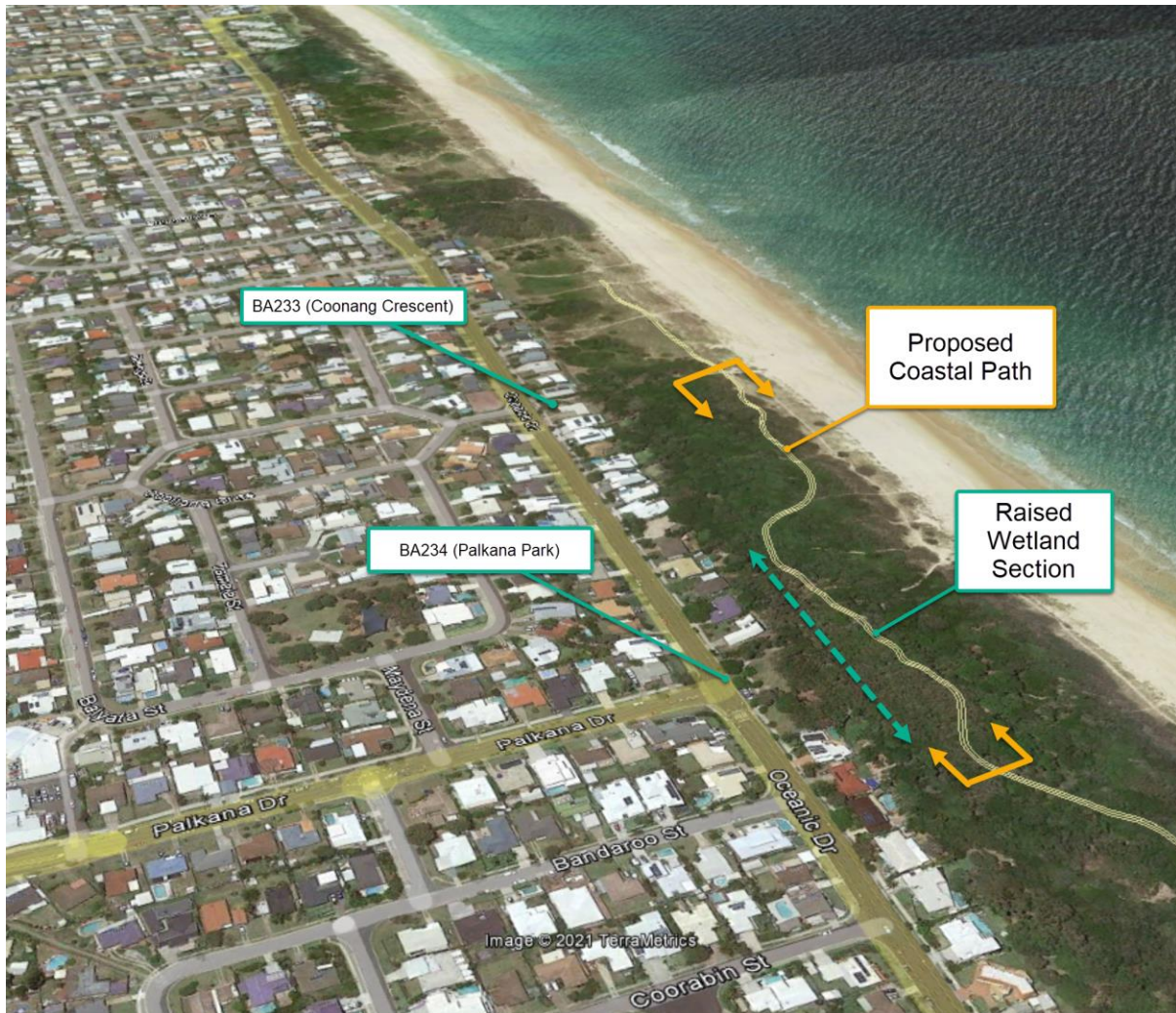
Figure 1 - Warana Coastal Path proposed alignment